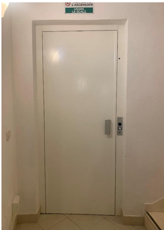
Ground floor elevator entrance

Already in place, but facility not serving the Auditorium