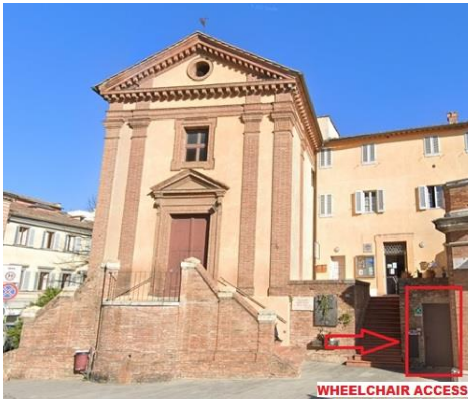
Future external access for people with disabilities

The S. Stefano Auditorium finally without architectural barriers